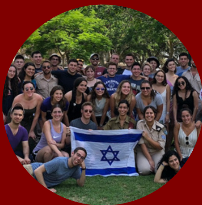
SEPHARDIC BIRTHRIGHT TRIP

DISCOVER HOW WE SUPPORT OUR NEXT GENERATION