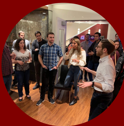
SEPHARDIC YOUNG PROFESSIONALS